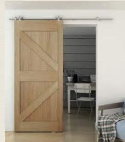
91_470 Stainless Steel Finish