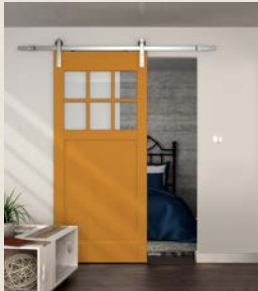
Brushed Stainless Steel