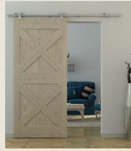
91_460 Stainless Steel Finish