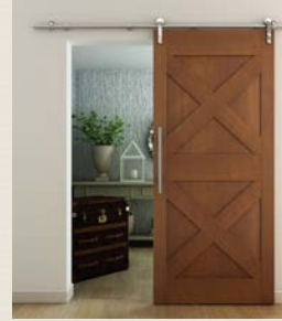
91_4100 Stainless Steel Finish