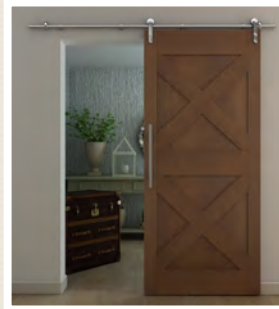
91-4100 | SST