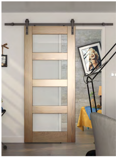
89 Series | Bronze