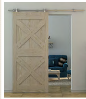
91-460 | SST