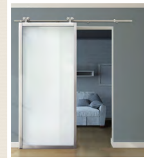
94-470 | SST Series with satin aluminum framed door