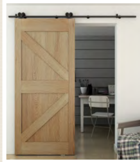
91-470 | Black